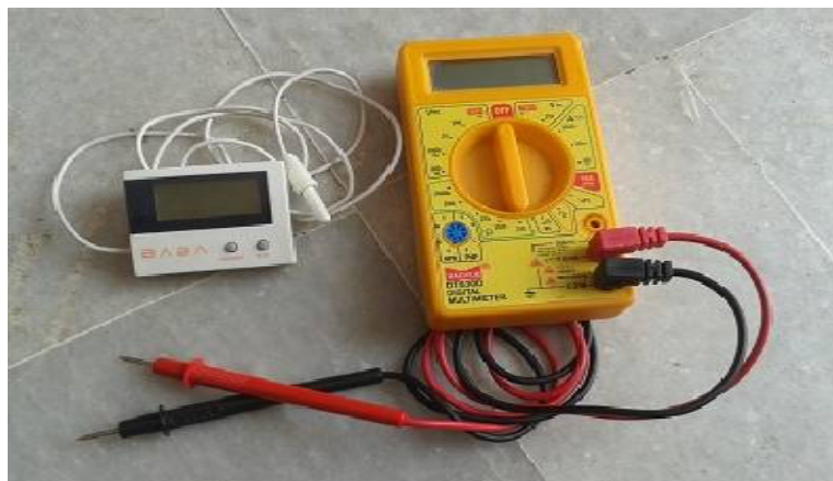
Figure 3.4: Digital temperature sensing device and millimetre