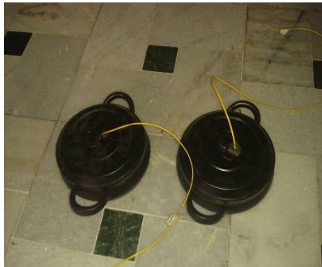
Figure 3.3: Cooking pots with thermocouples