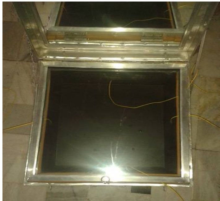
Figure 3.2: Box type solar cooker with top cover and thermocouple arrangement