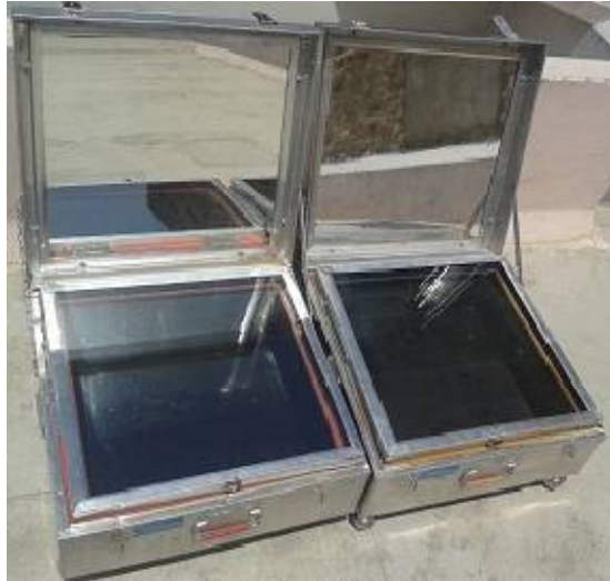
Figure 3.1: Two identical solar cooker use for experiment